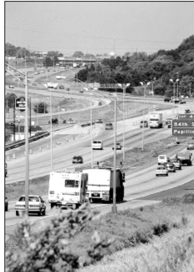
A Safety Message from the Nebraska Department of Roads and the Nebraska State Patrol

When you see an accident that the police are handling, do not stop out of curiosity .